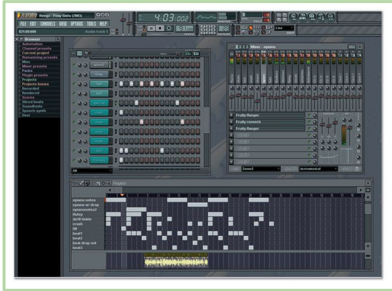
FL Studio: Digital Audio Workstation