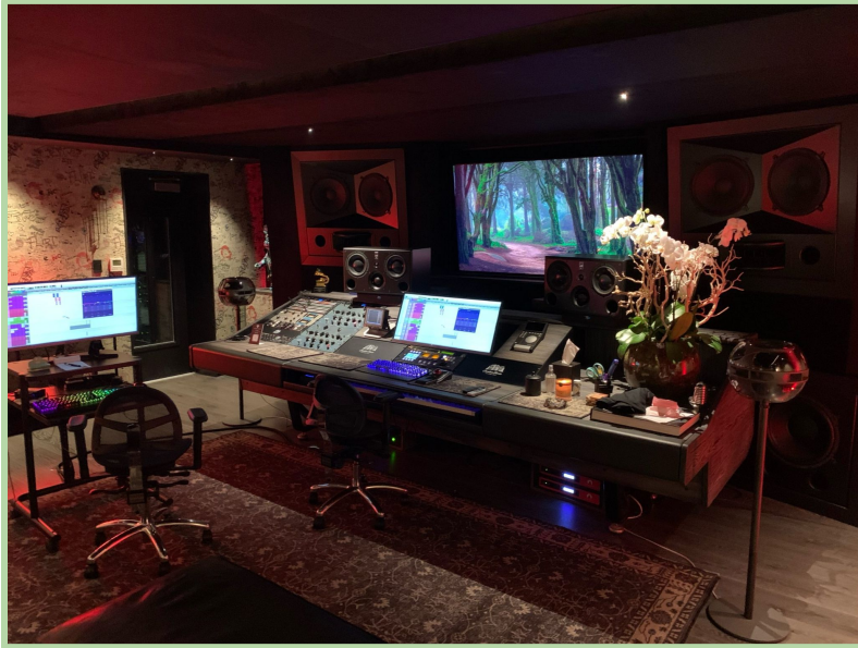
Larrabee Studio in Los Angeles