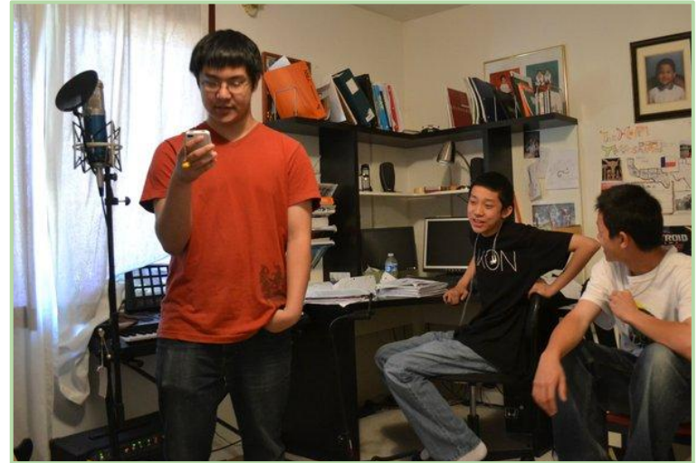
High School: Making music with friends