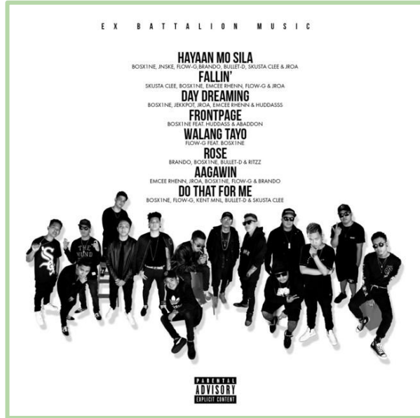
Ex-Battalion - Front Page